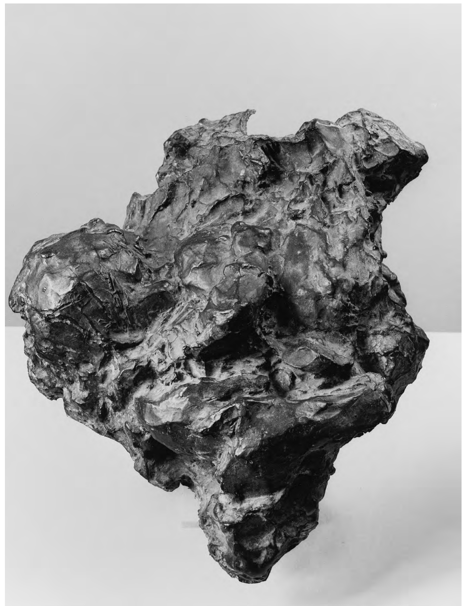
Left: Panel of the Fonte Gaia (Fountain of Joy) , Jacopo della Quercia copy made by Tito Sarrocchi, 1868